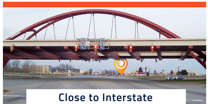
Close to Interstate