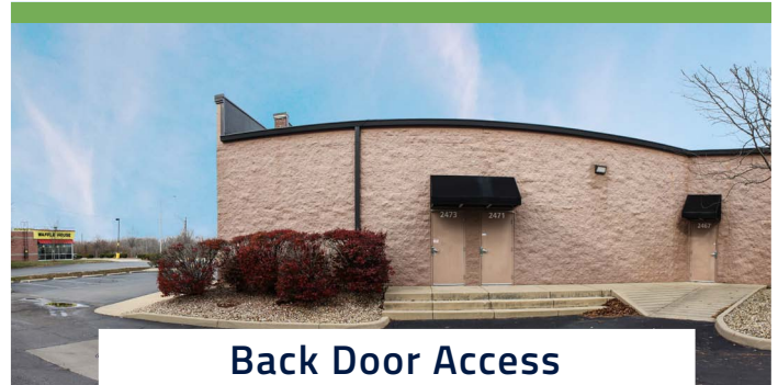
Back Door Access